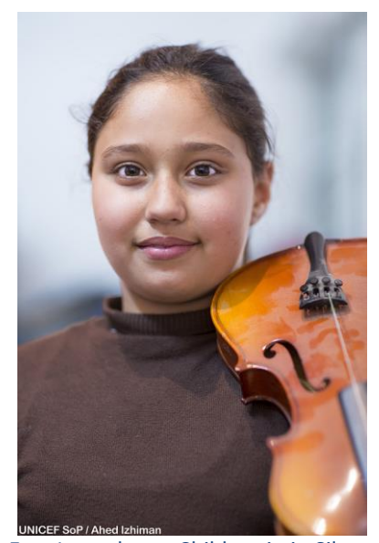
East Jerusalem – Children in in Silwan neighborhood are provided with psychosocial support services and after school activities through UNICEF programmes. Many children have been arrested during clashes around checkpoints.

With regard to education related violations, 286 incidents were reported last year, including raids, closure of schools as a result of direct attacks, delays at check points on the way to and from schools, interruption of classes and, in some