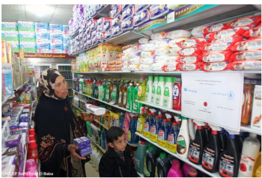
Gaza – Palestinian families redeem e-vouchers for school children. Since the beginning of the joint project between UNICEF and WFP more than 8,000 school children have benefitted from education supplies such as school uniforms, shoes and winter clothes.

In February, the Adolescent Development and Participation programme (ADAP), through its partners Al Nayzak, INJAZ, PalVision, Tamer, Save Youth Future Society and Ma'an Development Center supported 839 adolescents with skills development and training in implementing and leading initiatives addressing issues of conflict, violence, and social cohesion. Since the beginning of 2016 a total of 2,141 adolescents (43% female) have benefited from the programme.