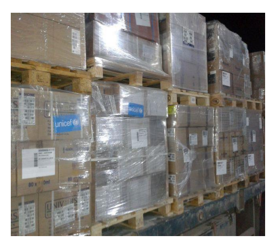
Gaza City – 186 pallets of essential drugs delivered by UNICEF to the Ministry of Health in Gaza.

Also in the West Bank, UNICEF distributed 13,529 packs (0.8 ton) of iron & folic acid tablets to the Ministry of Health that benefited more than 10,000 people.